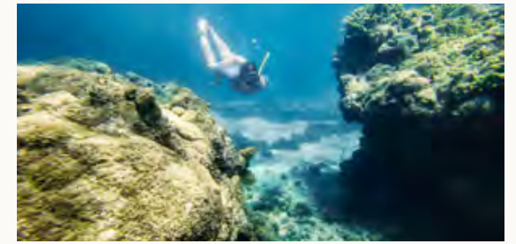
SNORKEL THE MARIETAS ISLANDS

Fish the waters, belay up a waterfall, or take to the bay via speedboat. Susurros del Corazón whispers to the intrepid spirit in all of us, young and old.