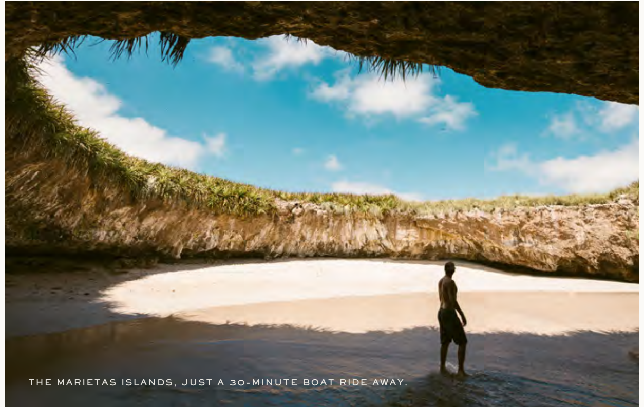
THE MARIETAS ISLANDS, JUST A 30-MINUTE BOAT RIDE AWAY.

To call this place home is to be at the crossroads of mountain, jungle, and sea. Susurros del Corazón is a gateway to it all, a community in harmony with the natural world.