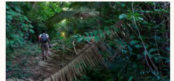
TREK THE TROPICAL JUNGLES