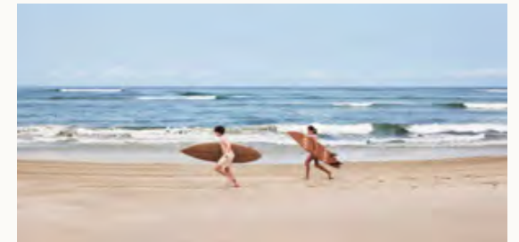
SURF THE BAHÍA DE BANDERAS