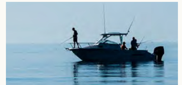
HOOK A LEGEND OFFSHORE