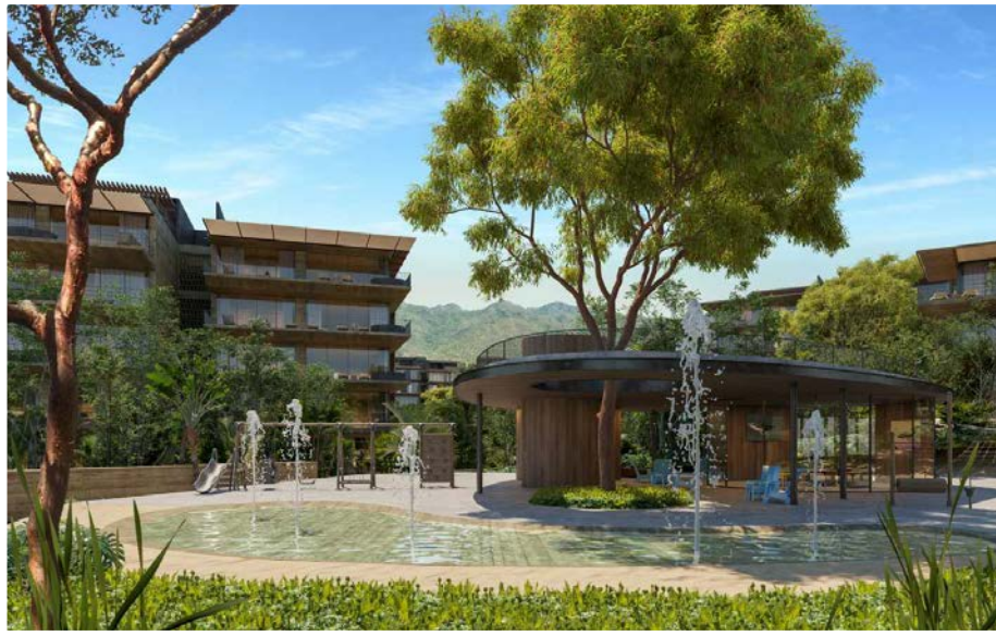
| Kids Club