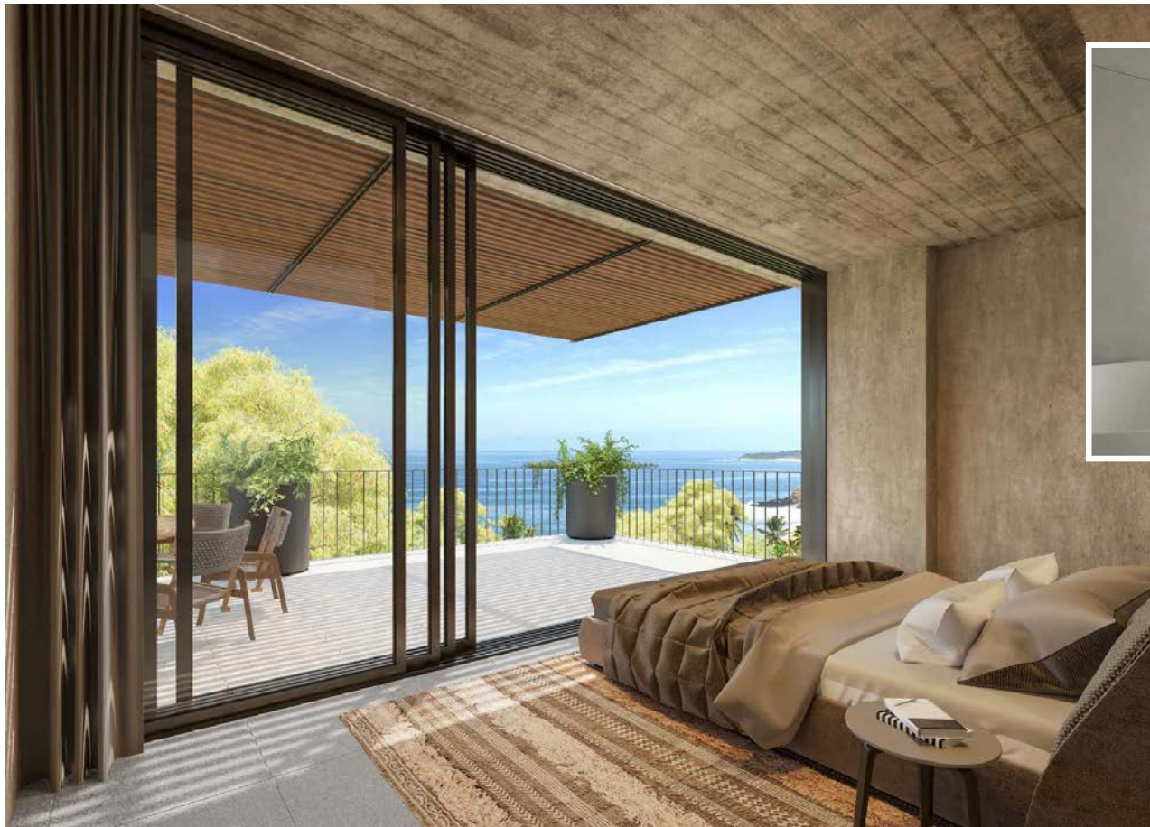
| Master Bedroom