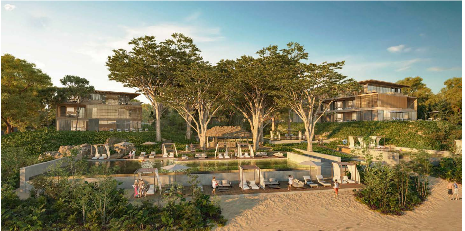
| Beach Club