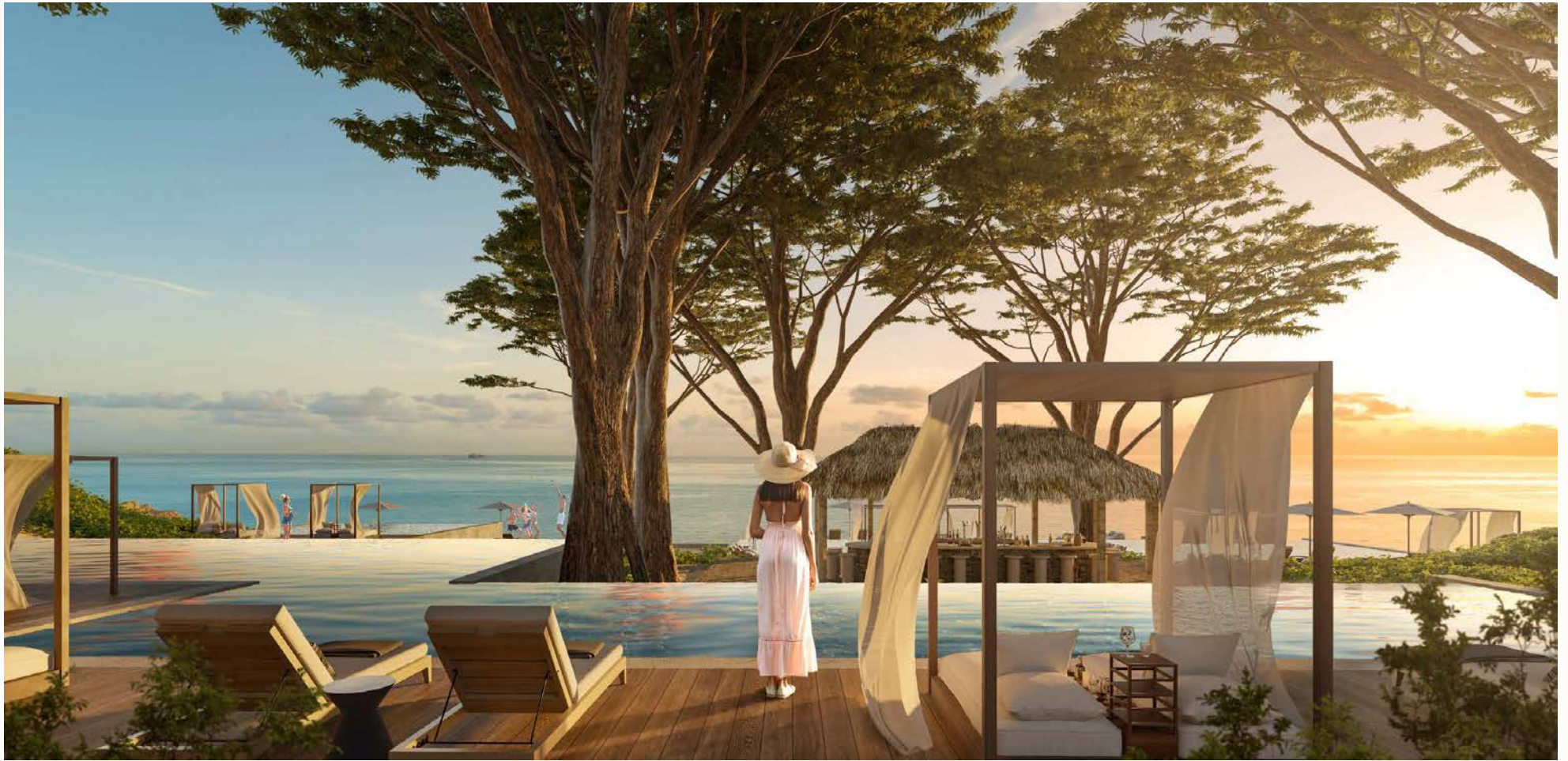
| Beach Club