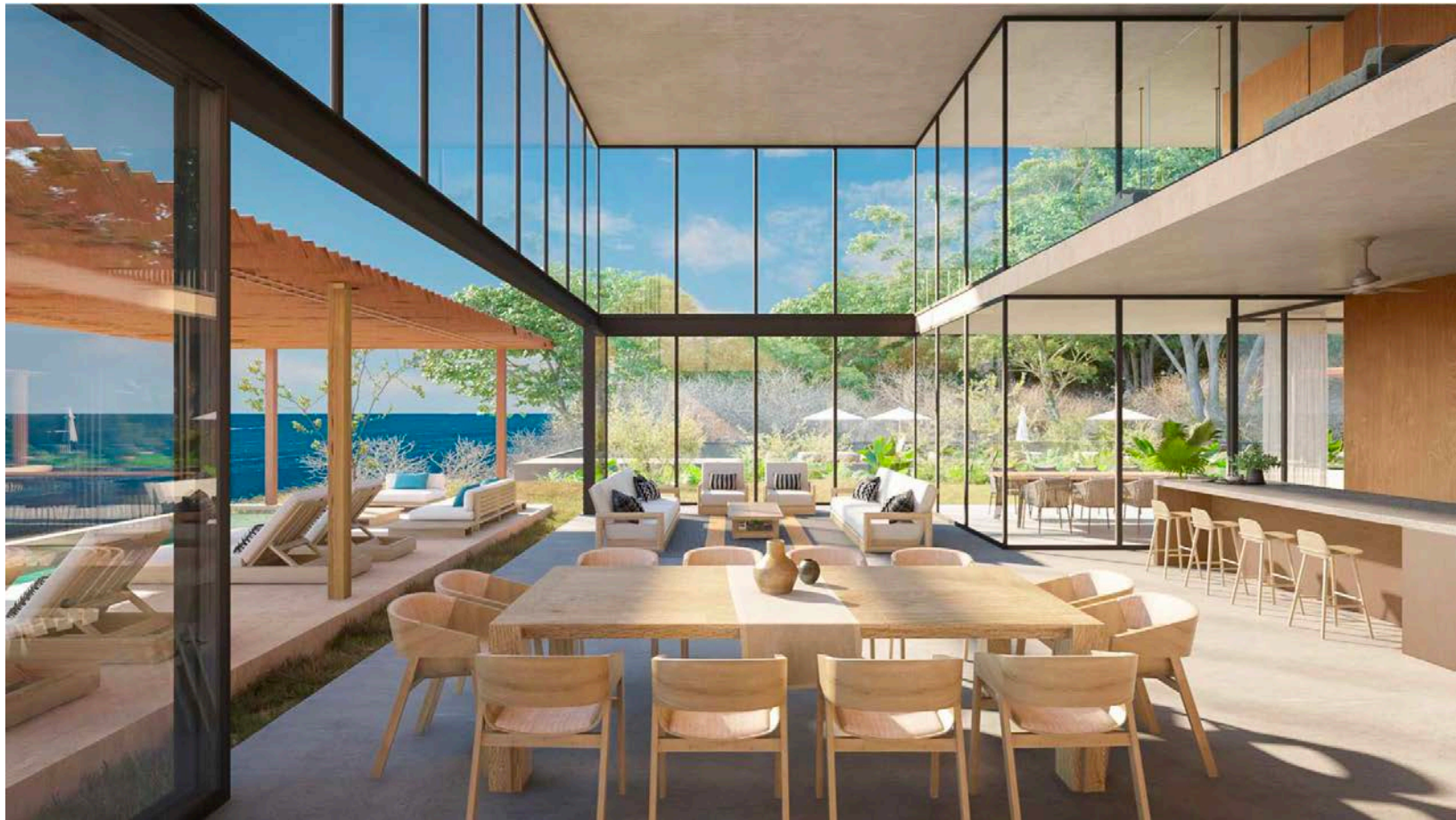
| Interior, Villa 2