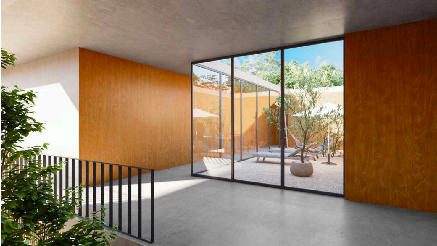
| Interior, Villa 2