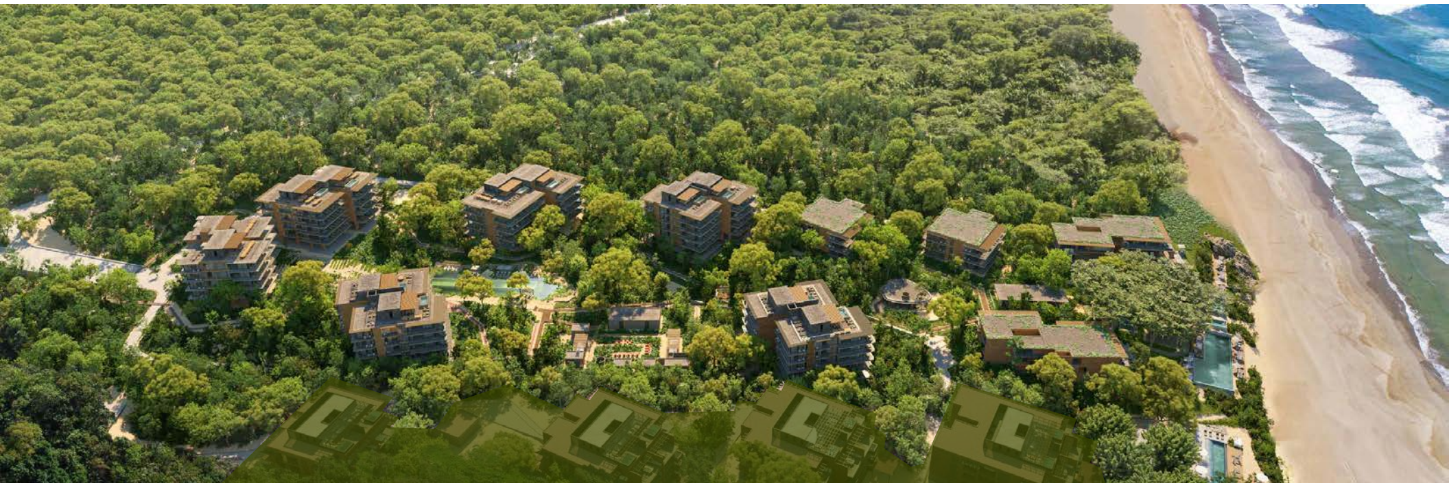
| Vista aérea