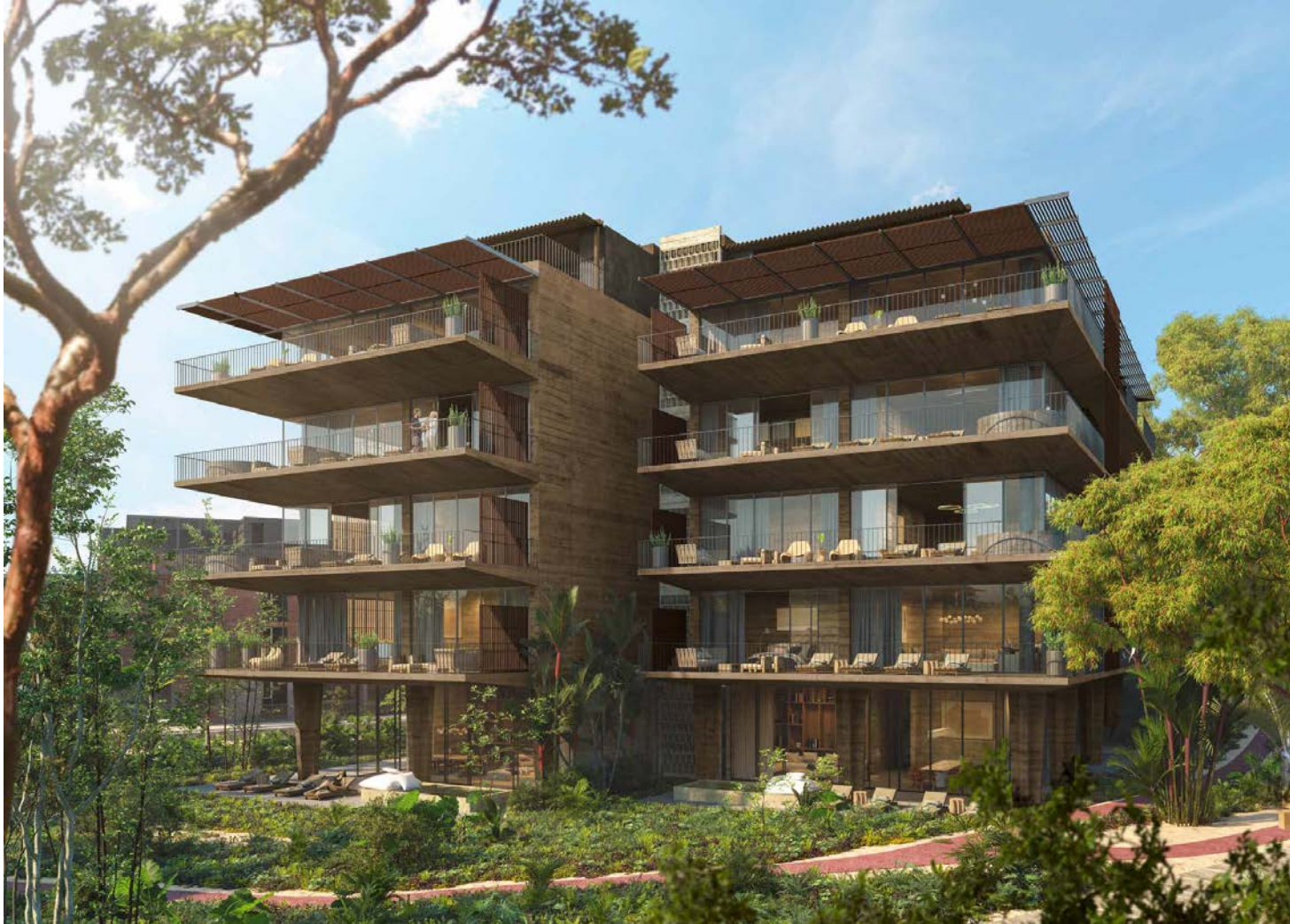
| Tower 3 & 4